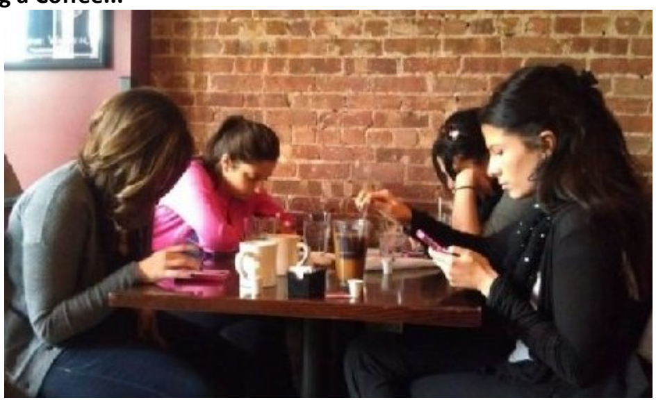
Get together in a restaurant...